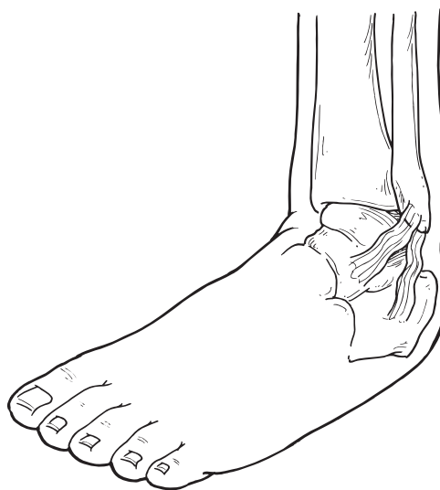
Injured ankle with laxity of ligaments

Chronic ankle instability usually develops following an ankle sprain that has not adequately healed or was not rehabilitated completely. When you sprain your ankle, the connective tissues (ligaments) are stretched or torn. The ability to balance is often affected. Proper rehabilitation is needed to strengthen the muscles around the ankle and “retrain” the tissues within the ankle that affect balance. Failure to do so may result in repeated ankle sprains.